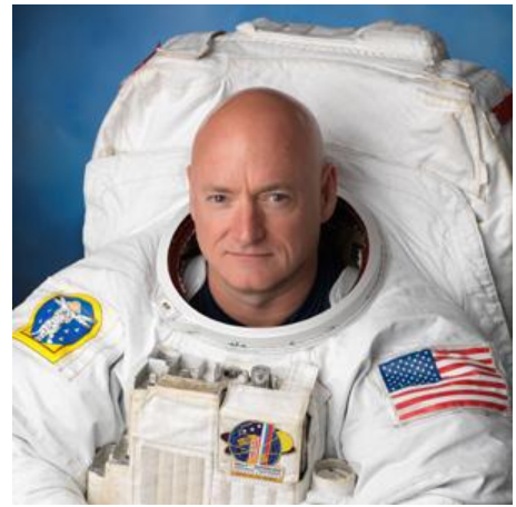
CAPTAIN SCOTT KELLY

inform inspire in touch with the world! omahatownhall.org